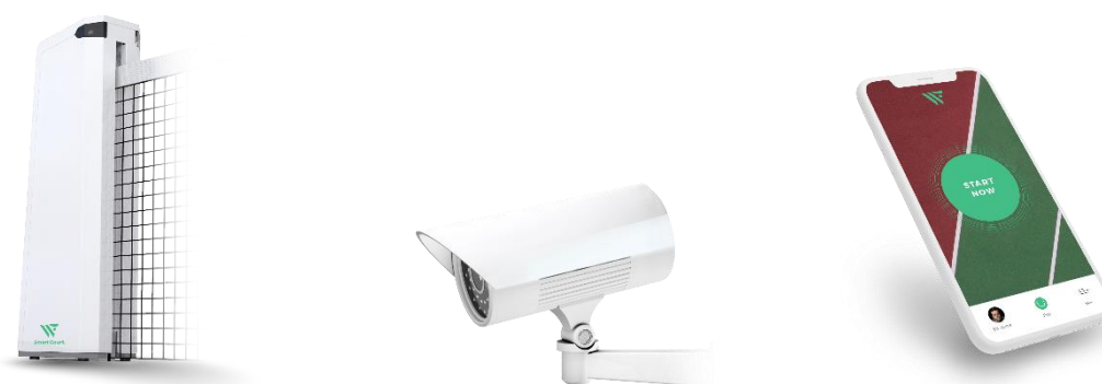
Figure 1. Components of the Wingfield system (from left to right): Wingfield BOX; Internet protocol camera; auxiliary device (smartphone). Not to scale.