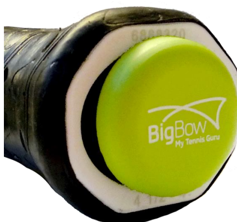
Figure 2. Basic pod, with protective cap, fitted to the butt of the racket.

A 'pod' containing electronic sensors (a triaxial gyroscope and triaxial accelerometer) is attached to the object of interest (e.g. a racket). Typically, the pod is either taped or fitted to the butt of a racket (see figure 2), but can also be attached to other equipment, e.g. a shoe, or the player's body. The sensors in the pod measure the orientation, acceleration and vibration of the object of interest. The mass of the Basic pod (with battery) is 3 g; the mass of the Basic 'Long-life' pod (with battery) is 9 g.