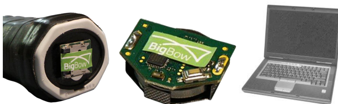
Figure 1. Components of the BigBow Basic Sensor system (from left to right): Basic pod; Basic 'Long-life' pod (with battery holder); auxiliary device (laptop).