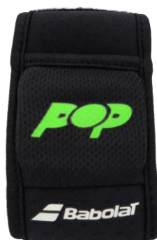
Figure 2. Babolat POP pod inserted in wristband.

A 'pod' containing electronic sensors (a triaxial accelerometer and triaxial gyroscope) is inserted into an elasticated wristband (see figure 2). The sensors in the pod measure the orientation and acceleration of the user's playing arm. The mass of the pod is 9 g. The mass of the wristband is 10 g.