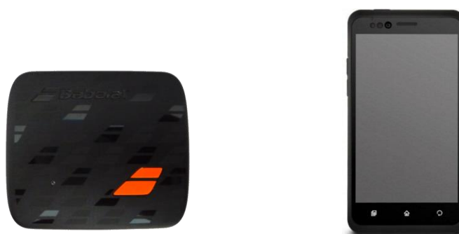
Figure 1. Components of the Babolat POP system: Babolat POP pod (left); auxiliary device (smartphone).