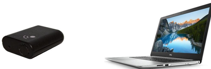
Figure 1. Components of the Armbeep system (from left to right): Armbeep device and auxiliary device (laptop). Images are not to scale.