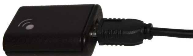
Figure 4. USB cable connected to the Armbeep device (to download data).

To transmit the data, the device must be connected to an auxiliary device, e.g. a laptop, via a USB cable (see figure 4). The Armbeep Uploader software must be installed on the laptop to transfer the data from the device to the Armbeep server (via the internet).